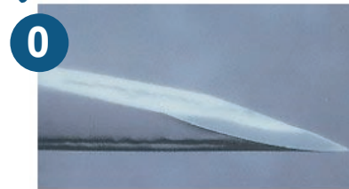
Syringe Needle AFTER ONE Use