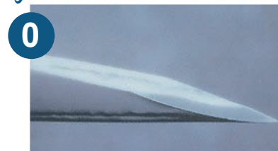
Syringe Needle AFTER ONE Use